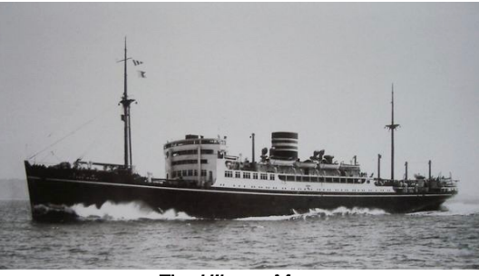
The Hikawa Maru

Sadly, however, some two years later when Kano was returning from the 1938 IOC meeting that had gathered in Cairo, Egypt, he died at sea onboard the Hikawa Maru on May 4, 1938 at the age of 77. The international political situation at that time was becoming increasingly unstable and the world soon after descended into a state of horrifying warfare. Thus, the strenuous efforts of Kano had proved futile when the IOC announced that the 1940 Tokyo Summer Olympic Games and the ensuing 1944 Games that were scheduled for London were both cancelled.