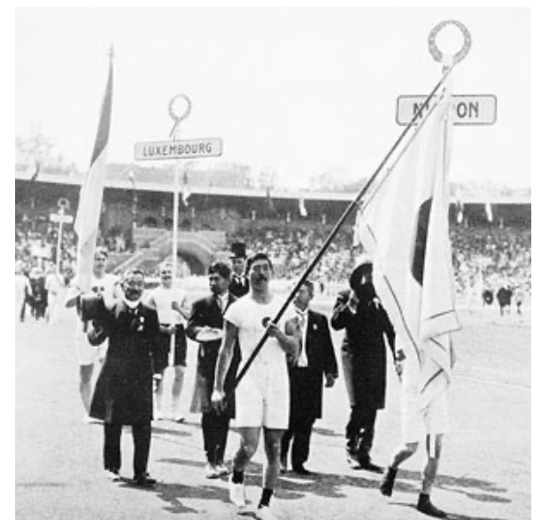
Jigoro Kano during the opening ceremony of the Fifth Olympic Games in Stockholm in 1912

Tokyo has been awarded the honour of staging the Summer Olympic Games three times. The first occasion, thanks mostly to the exertions of Jigoro Kano (1860~1938), was the 1940 Games, but they were later cancelled owing to the outbreak of the Second World War (1939~1945). Next was the year 1964 when a most successful event was held. The third time will be this year, when 10,000 leading athletes from 205 nations are scheduled to converge on Tokyo and compete from 24 July to 9 August 2020, for the 32<sup>nd</sup> Olympiad.