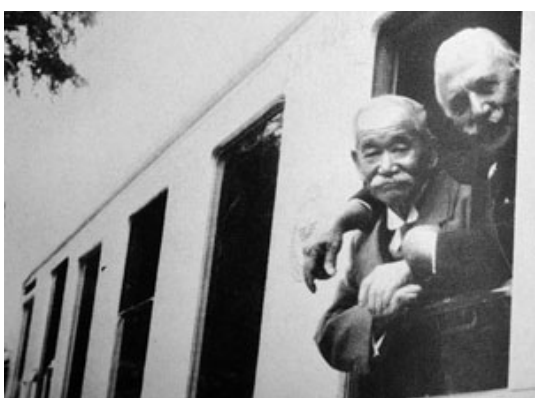
Jigoro Kano on his way to North America following The IOC Session in Cairo

was cast by a very slim majority to award the 1940 Summer Olympic Games to the Japanese capital. Kano was elated.