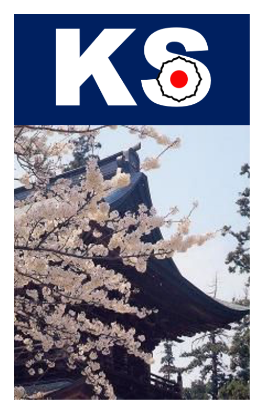
PO Box 45408 • London • SE26 6WG • United Kingdom

An ex-university lecturer, he is currently employed as a Japanese language translator and English correspondent for the Imperial Hotel, Tokyo