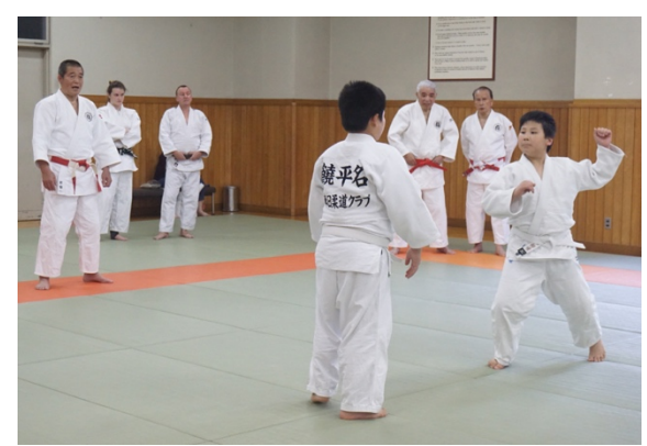
Young judo students practicing kata under the supervision of high ranking Kodokan instructors

When it comes to teaching the art of judo , the main priority for the instructor should be to take every possible precaution to avoid student injuries. If children are injured while practicing, their parents will no doubt take a dim view of judo , consider it to be a dangerous activity, and perhaps forbid their child from further participation. In most sportive activities, of course, accidents and possible injury can happen. However, since judo is a non-violent activity and provided training is carried out under strict and experienced supervision, injuries should be of rare occurrence.