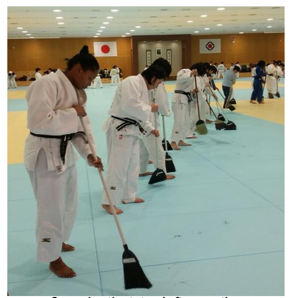
Sweeping the tatami after practice

Because Japanese students know that etiquette lies at the base of budo and also know exactly what is required of them. normally there is little friction among the dojo membership. Each student's behaviour is constantly monitored by the instructor. If a student, for example, fails to bow properly when he enters or leaves the dojo, which is the custom when entering a temple or some other building of especial merit, or shows any other disrespect or inappropriate behaviour, he is quickly reprimanded by either a senior student or by the instructor. Therefore, perhaps because of such regular discipline at school as well as the dojo, there is little vandalism by the young in Japan. Thus, a civil and harmonious atmosphere is routinely maintained in many Japanese budo dojo. Such mores encourage dignity and admiration not only for the instructor but also for the dojo itself, and it is this respect for the instructor-dojo unit, which forms the basis for good order, manners and most importantly safety. During my three-year judo training at a Japanese university, I occasionally saw a few violent and inappropriate incidents among the students. These occurred on the very rare occasions when the instructor was either late or absent. Therefore, it is most desirable that at every judo session a senior figure should lead the training and see that discipline is always strictly maintained.