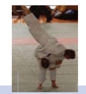
Kata at the World Masters Tournament Japan 2003

After a contest you found you had made a new friend and it was great to meet old friends from all over the world, some that you had not seen for many years. This was guite different from a young persons event and I felt lead to far more new friends being made.