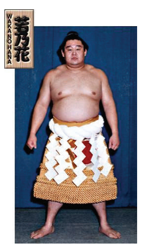
Wakanohana wearing the pure white rope