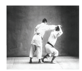
Kano performing Kata at the Kodokan

cornerstone of Judo practice. We support intensive training and believe that randori should be its main component involving upright Judo (shizentai) and practice which aims to throw cleanly for ippon. We deprecate over-reliance on bent posture (jigotai) and such techniques as leg grabs and holds which pull the opponent down into a crouch as