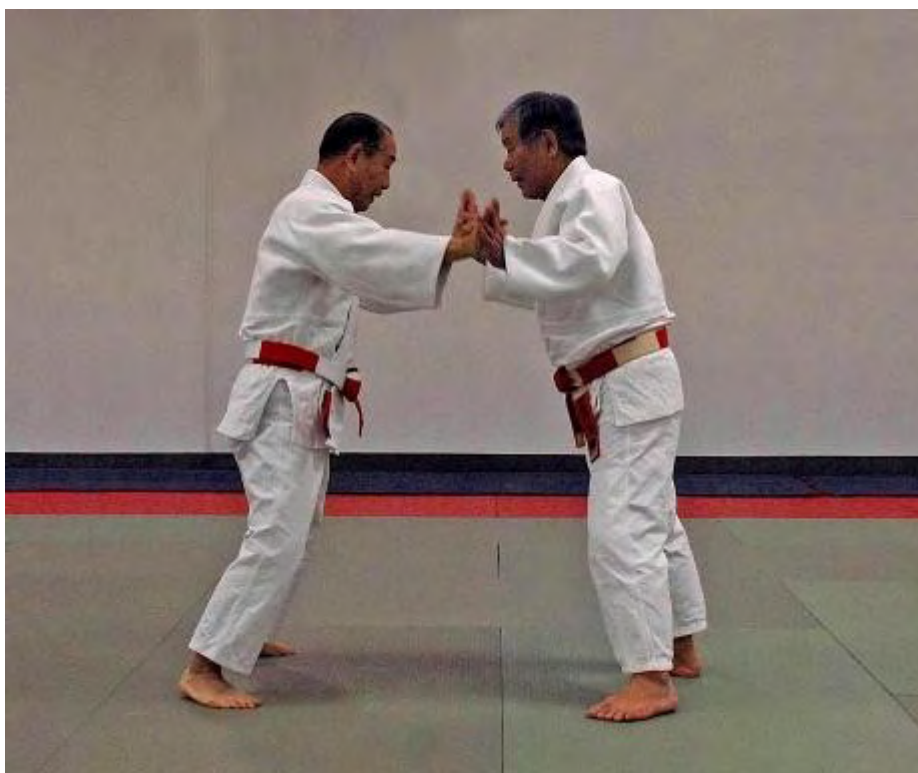
Figure 6 - Preliminary movements to Hidari-seoi-nage