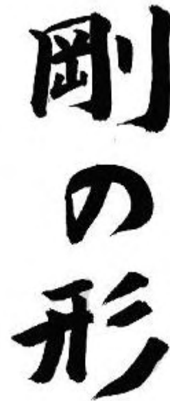
The ‘tenth’ kata, Go-no-kata [Figure 1],

Over the last five years or so the international judo community has witnessed a renaissance in kata practice, driven largely by the increasing organisation of international kata championships. Notwithstanding this recent upturn in interest, the true educational cohesion between randori and kata has been largely lost during the progressive ‘sportification’ of judo —which is now often reduced to a crude conglomerate of isolated throws merely based on power, endurance, and