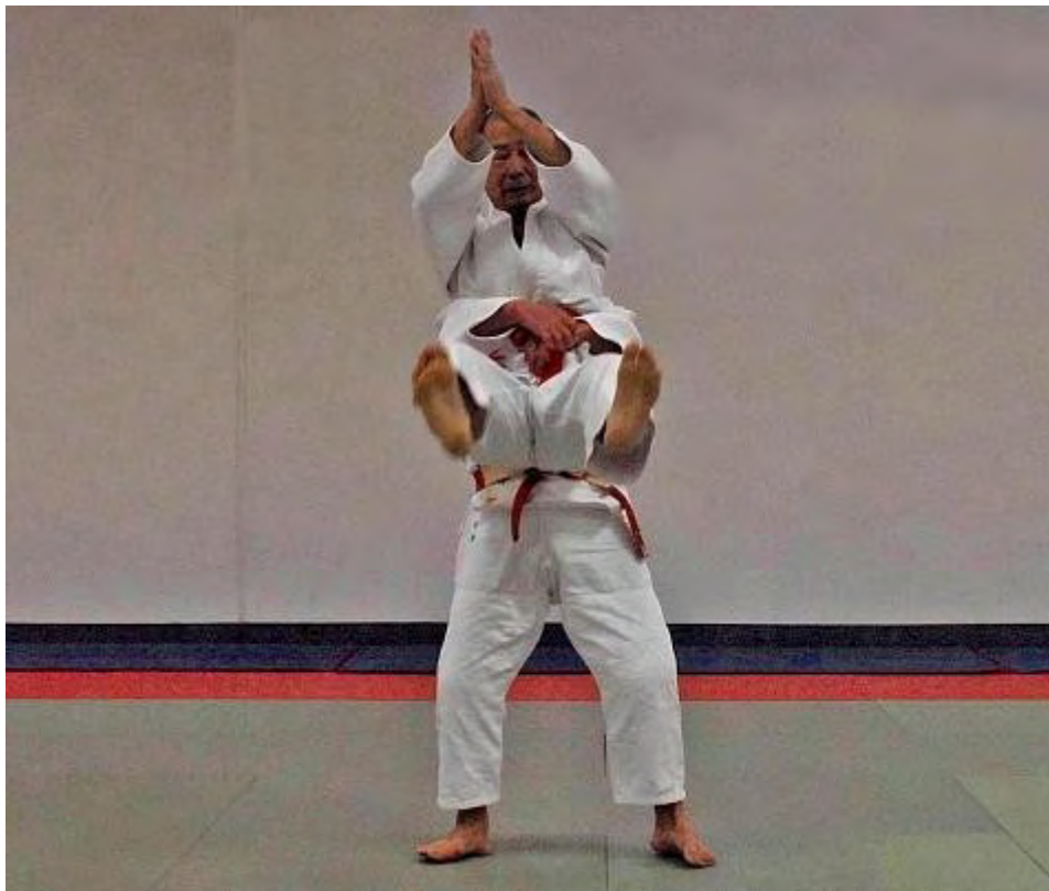
Figure 5 - Ushiro-goshi

“ Go-no-kata or at times called Go-Ju-no-kata , I remember having taught it some time in the past but my study was not complete; three or four out of the total ten forms in it, I did not like. I had thought of reviewing it but left it as it was.