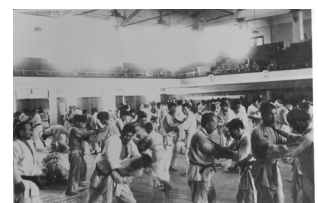
Early Judo practice at the Kodokan 1935

Shiai - contest- is an important aspect of training. We support experimentation with the contest rules to discover a formula for clean upright Judo. Kangeiko (the winter training period) has a valuable role.